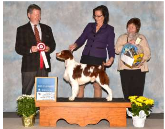
BEST OF OPPOSITE SEX: GCH TRIUMPHANT'S AS GOOD AS IT GETS JH