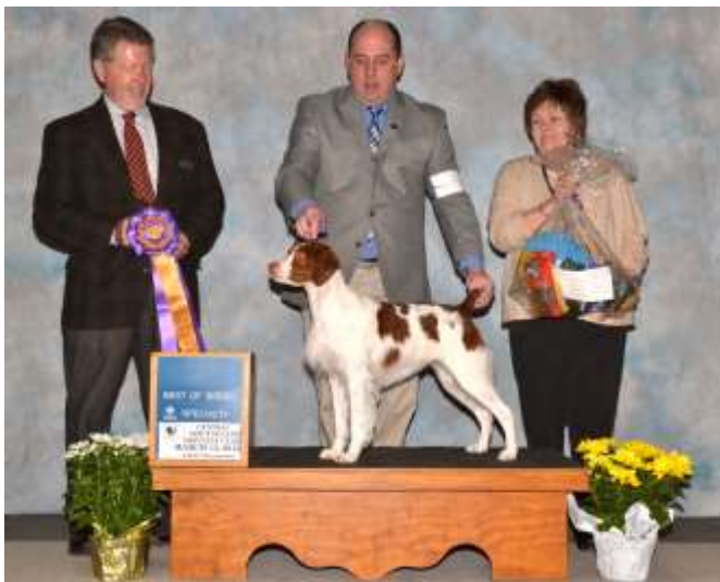
BEST OF BREED: GCH MILLETTE'S SWEET MEMORIES BN AX AXJ NF NAP NJP CGC