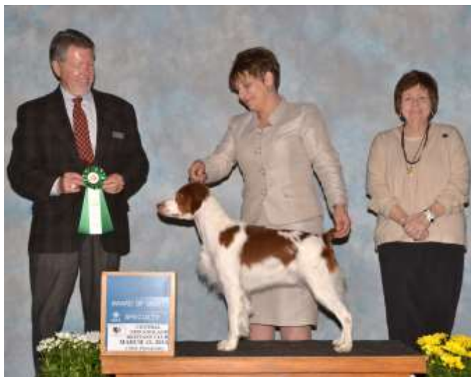
AWARD OF MERIT: GCH CH MAPLE BROOK'S GREAT BALLS OF FIRE JH