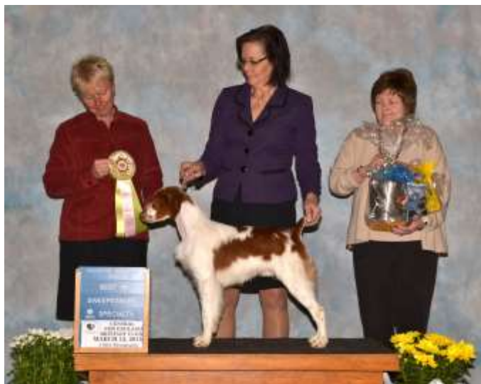
BEST IN PUPPY SWEEPSTAKES & RESERVE WINNERS DOG: MAPLE BROOK HEARTS ON FIRE