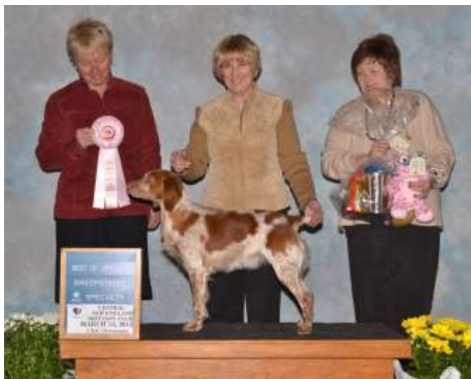
BEST OF OPPOSITE SEX IN PUPPY SWEEPSTAKES: SHADY BROOK'S MON AMI CHERIE'