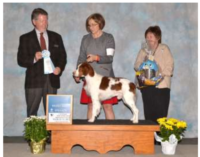
SELECT DOG: CH CASTLE'S ROBBINS ON THE TOWN