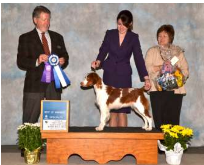
WINNERS BITCH & BEST OF WINNERS: SIPPEWISSETT'S AS GOOD AS IT GETS AOIFE