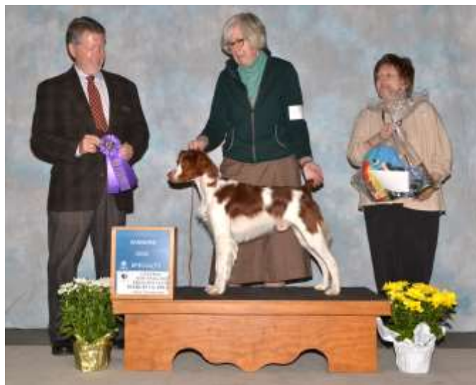
WINNERS DOG: TOP SHELF'S FRIENDLY PERSUASION