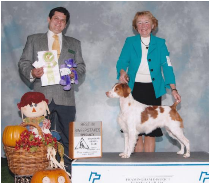
Ch. Shady Brook's Star Wish "Zoe"