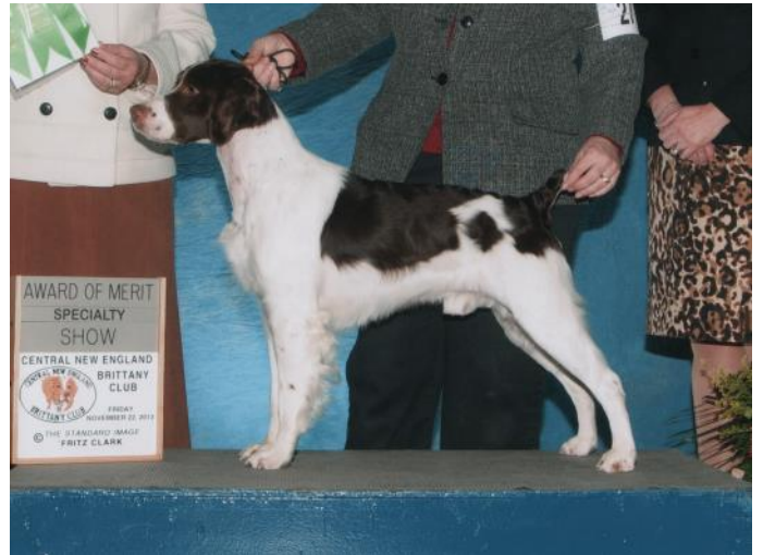
Award of Merit: CH Hill's Mid-Night Express