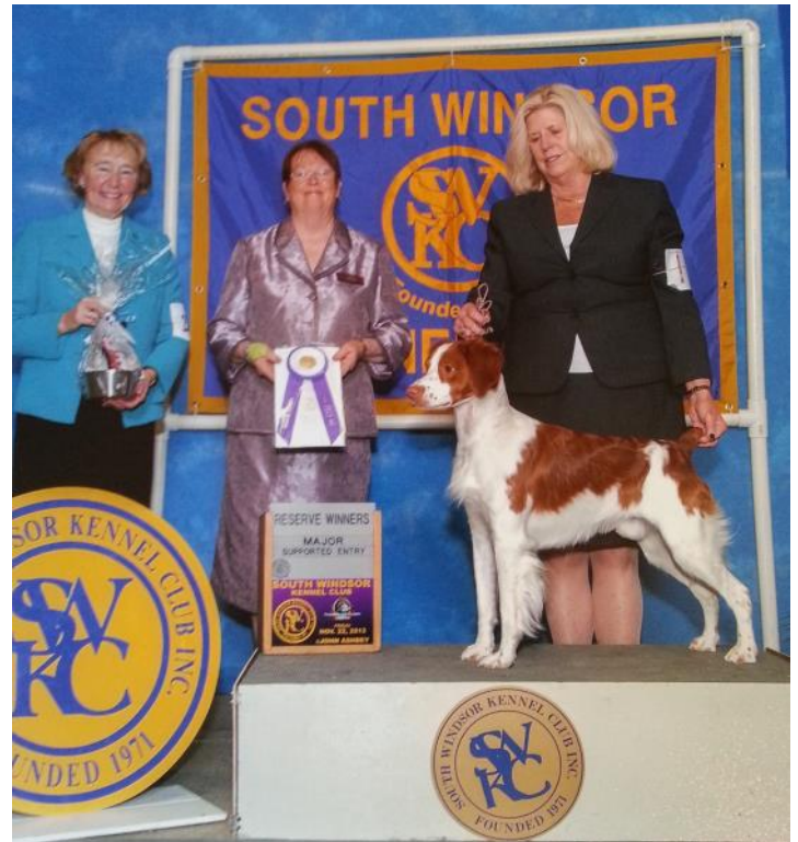
Reserve Winners Dog: Triumphant Millstone Come To My World