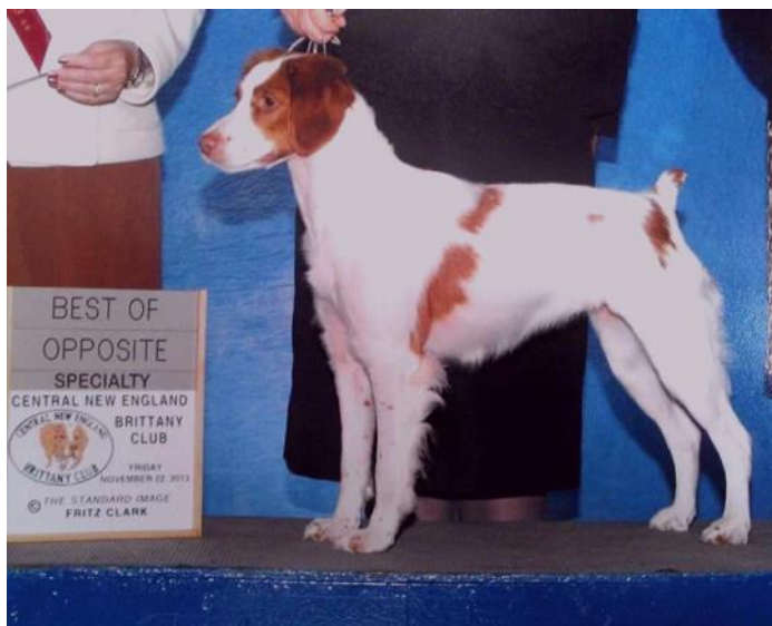
Best of Opposite Sex: CH Saradac's Smokin' Blanca Tatanka