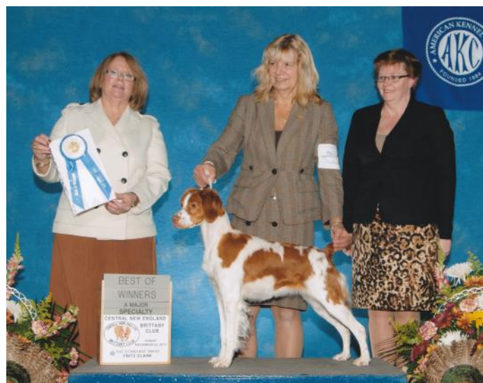
Winners Bitch/Best of Winners: Maple Brook's Some Like It Hot