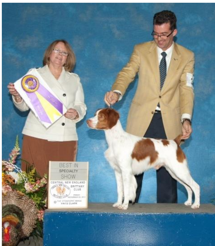
Best of Breed: GCH Marsport Hot To Ride Lucky Seven MH