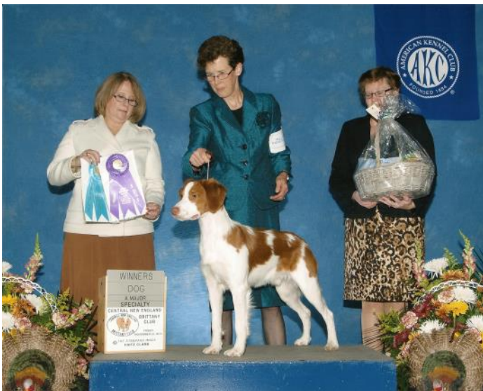
Winners Dog & Best Puppy: Kinship's Triumphant Pursuit