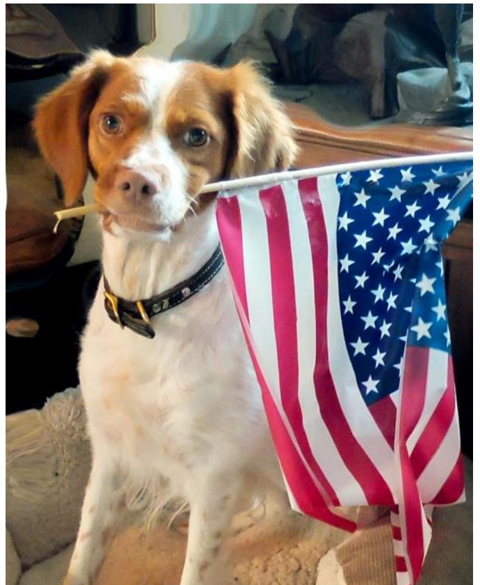
CH Shiloh's Swift Kiss A Taq