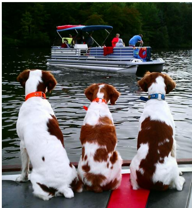
Tonka, Aja, Tiki on a swim pad of a boat, and they are watching the folks on the pontoon feed the ducks. .